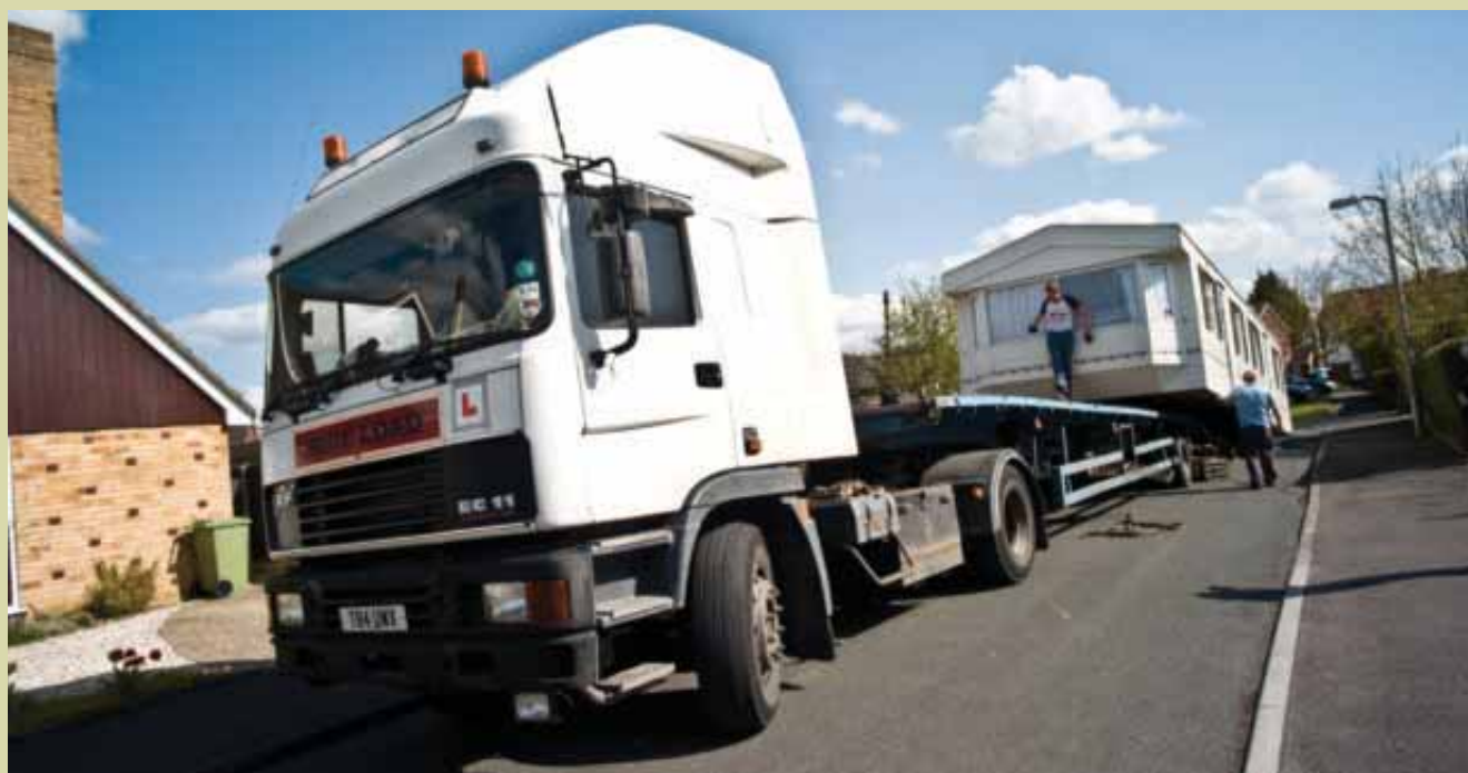
Photo: delivery of a caravan for temporary housing in Tewkesbury.

The 2008 National Capability Survey (carried out a few months after the Guidance was published) showed that all Local Resilience Forums responding to the survey were aware of the NRG, and many were already putting multi-agency recovery plans in place based on the Template Plan. This significant increase in awareness of recovery issues should mean that emergency responders are now far better placed to help communities back to normality as quickly and effectively as possible, using pre-planned arrangements.