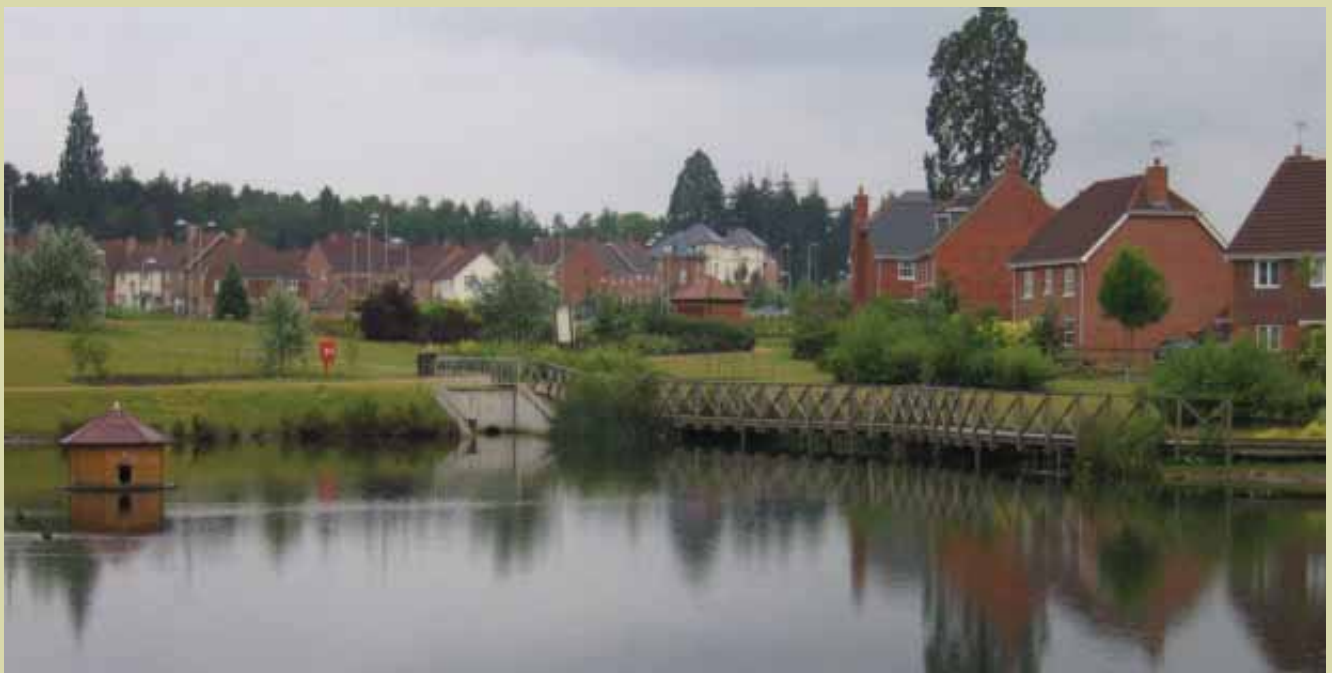
Village pond, Elvetham Heath, Hampshire